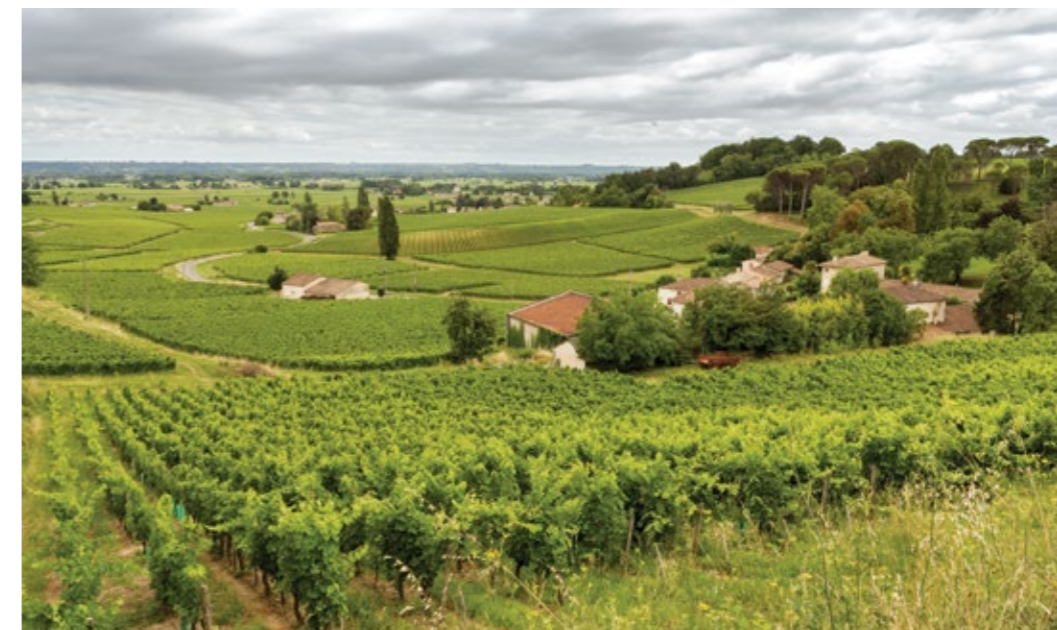
The "Right Bank" of Bordeaux, pictured outside the medieval village of Saint-Emilion

W e were standing in the middle of one of the giant wine cellars at Millesima, the international wine retailer based in the heart of Bordeaux, within a quick barrel roll of the Garonne River. To imagine the bottles—nay, the oceans—of the world’s finest wines that have left this place to be poured into glasses around the world over the centuries... It is unfathomable.