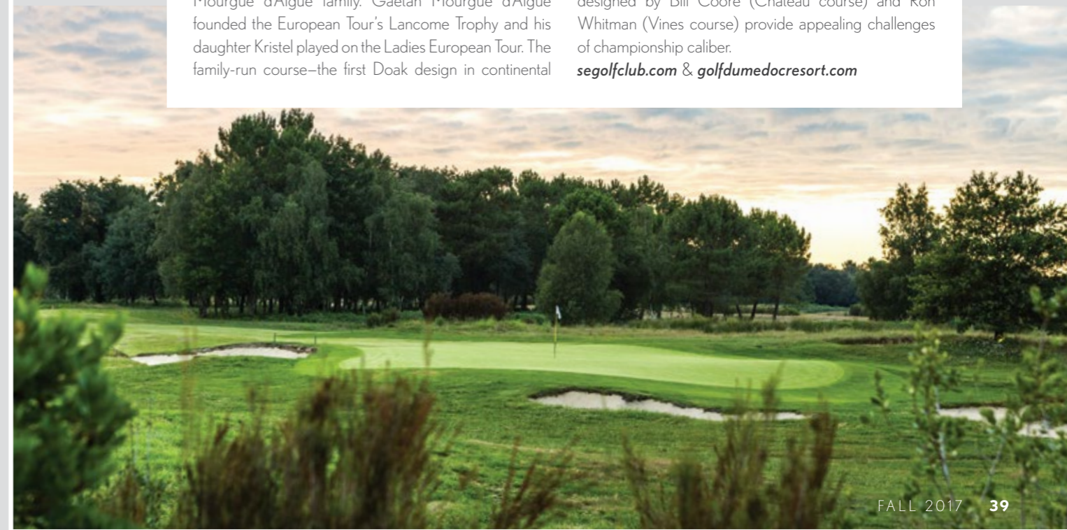
The charming woodland setting of Grand Saint-Emilionnais (above) and Golf du Medoc (below)