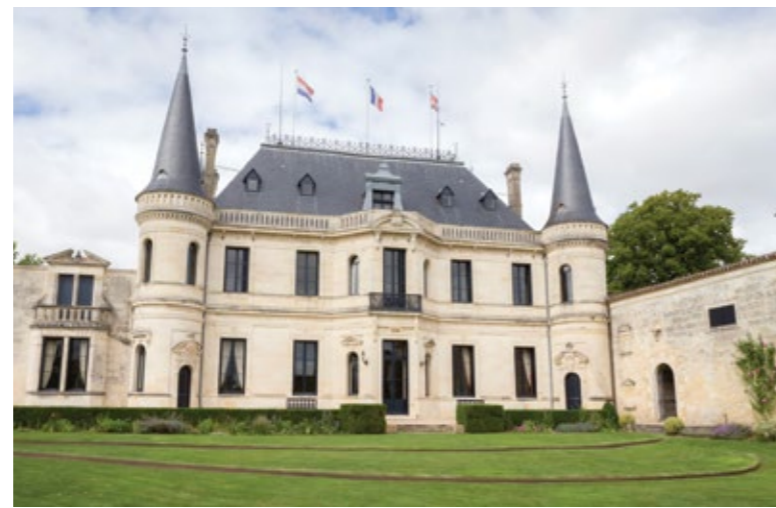
Chateau Palmer and (below) its owners’ private store under the protection of Archbishop Berland

That’s fine, I don’t want to buy one, just taste it... apparently a wine of this extraordinary quality will keep for 80 years. I relay Barnard’s estimate of €10,000 for a bottle of 1961 (or €40,000 for a double magnum). “For Chateau Palmer 1961 there is no price,” comes the correction. Even Matteo does not have the keys to this cellar.