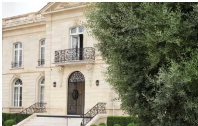
Saint-Emilion (top), La Grande Maison (above), the bar in Le Grand Hotel (right) and Bordeaux’s bistro culture (below)

Also enjoying ever-increasing demand is Bordeaux’s Le Grand Hotel, a five-star, 130-room InterContinental Hotel located in the very heart of the city, on the Place de la Comedie and opposite the city’s equally imposing Opera House. The hotel features two Gordon Ramsey restaurants, Le Bordeaux Gordon Ramsey, which is streetside, and Le Pressoir d’Argent, offering an exquisite fine-dining experience and which has been awarded two Michelin stars.